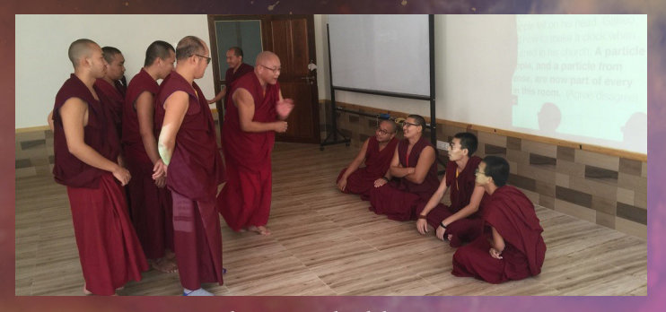
Tibetan monks debating

The monks are generally keen to learn about the modern Western approach to science and many support that a new way of thinking must be embraced when dealing with scientific questions. One monk quoted the Dalai Lama in this respect,